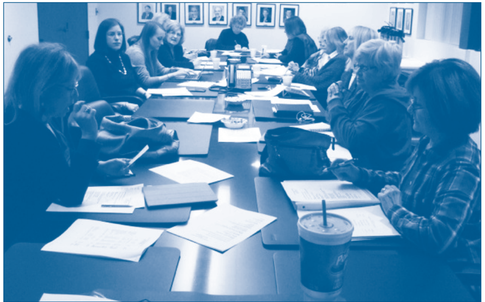
NCJW GNO Community Service Committee Hard at Work!