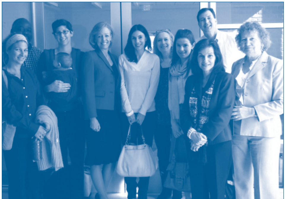
NCJW visits Kingsley House